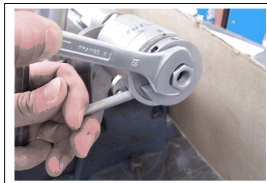
5°) Insert the stop pin