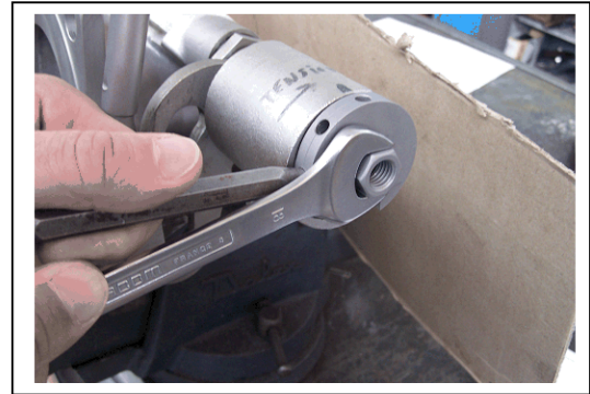
2°) Position a wrench on the tool hexagon bend the spring rotating clockwise