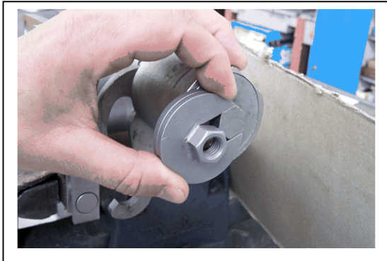
1°) Install the tool on spring box